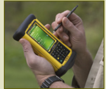
SUNLIGHT READABLE VGA DISPLAY