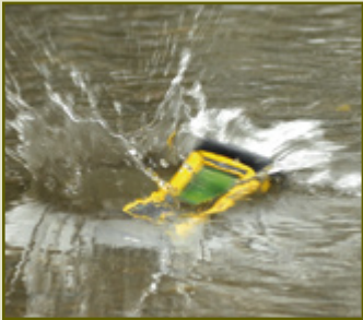
RUGGED AND WATERPROOF