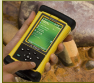
WINDOWS MOBILE 6